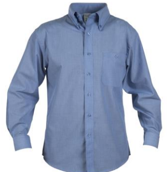
Sea Scout Uniform £24.00