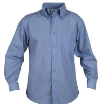
Sea Scout Uniform £24.00