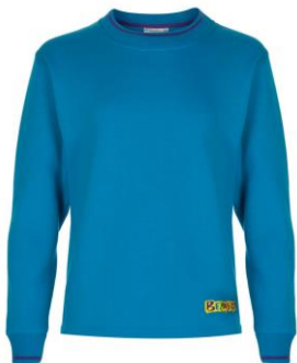
Beaver Uniform £14.00

Once your young person has decided they wish to stay with the group please visit the shop to purchase the correct item and we will then arrange with you to invest them into the group after they have learnt the Promise and Law.