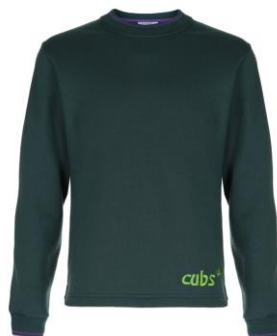
Cub Uniform £14.50