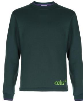
Cub Uniform £14.50