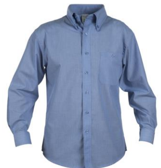
Sea Scout Uniform £24.00