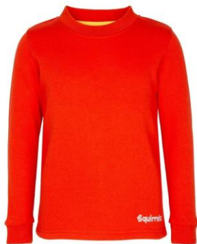
Squirrels Jumper £14.50